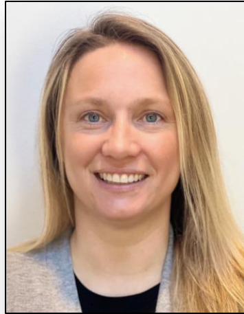
Terra Delong Region 1 Liaison

jbright@wreathsacrossamerica.org 207-618-5078